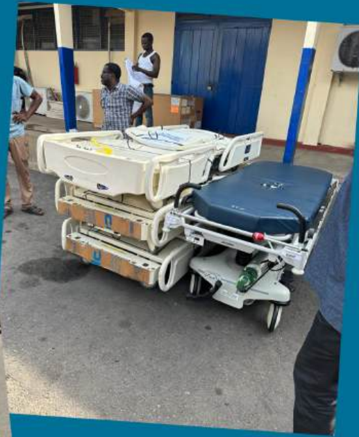
Hospital beds arriving at the Korle Bu Teaching Hospital