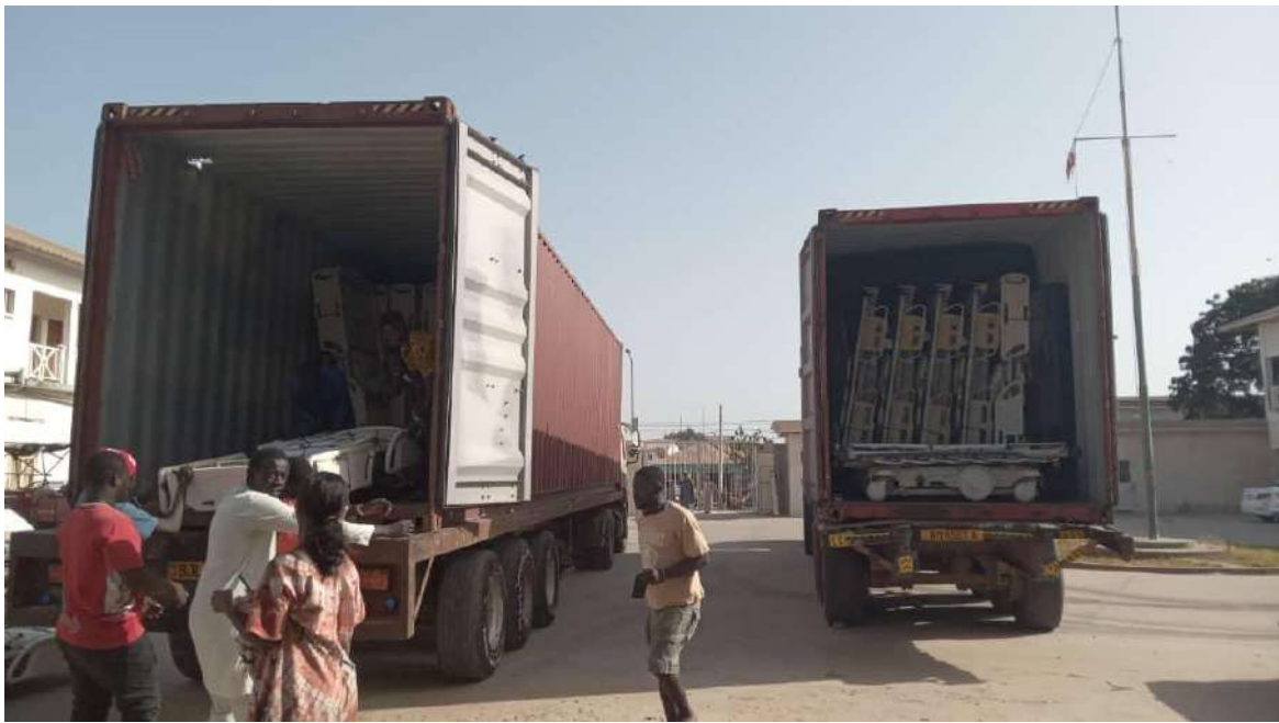
Two containers getting unloaded simultaneously in The Gambia.