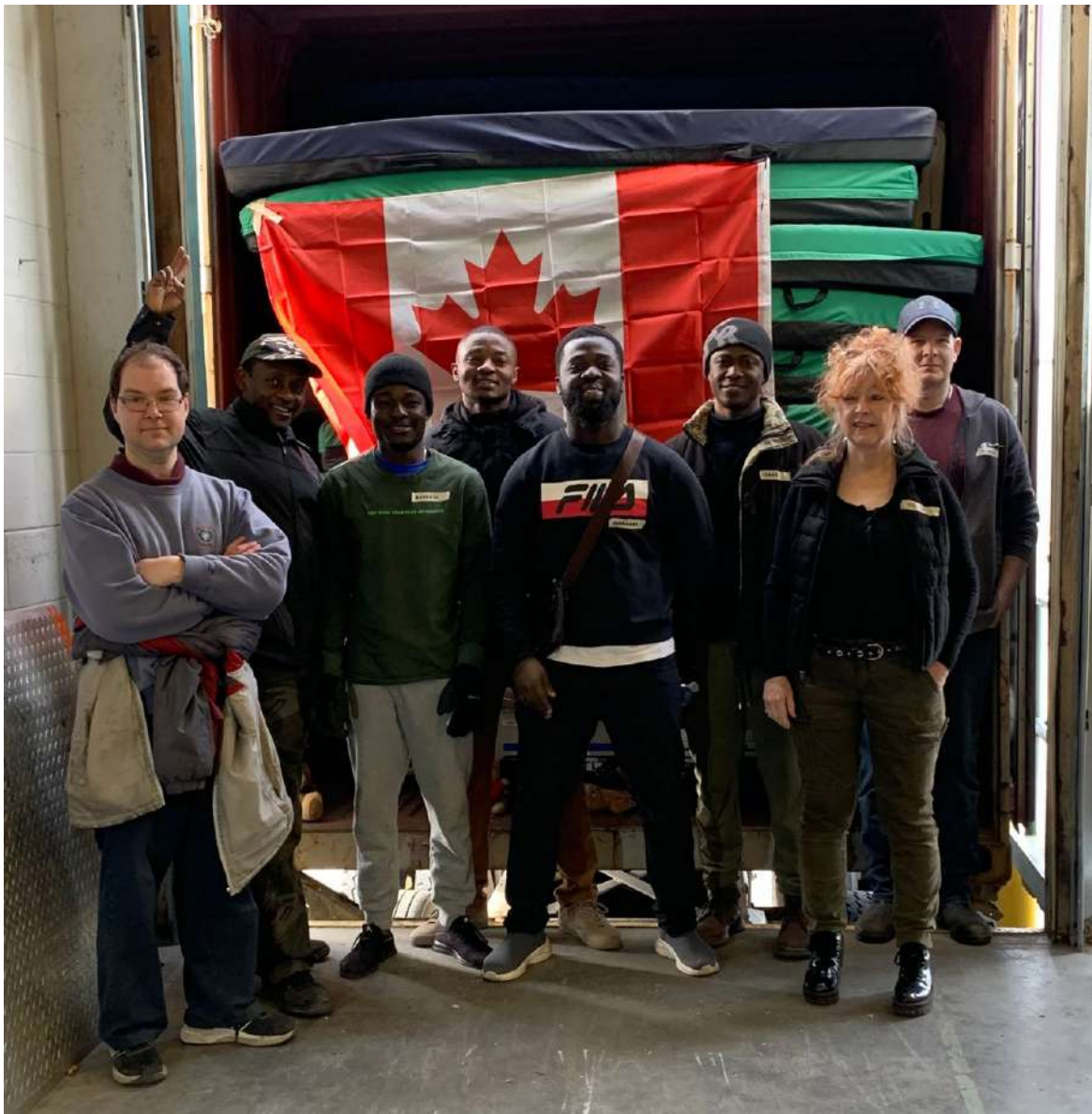
In February this year, a small but mighty team of volunteers loaded a container in Vancouver with 40 beds, mattresses and one stretcher.