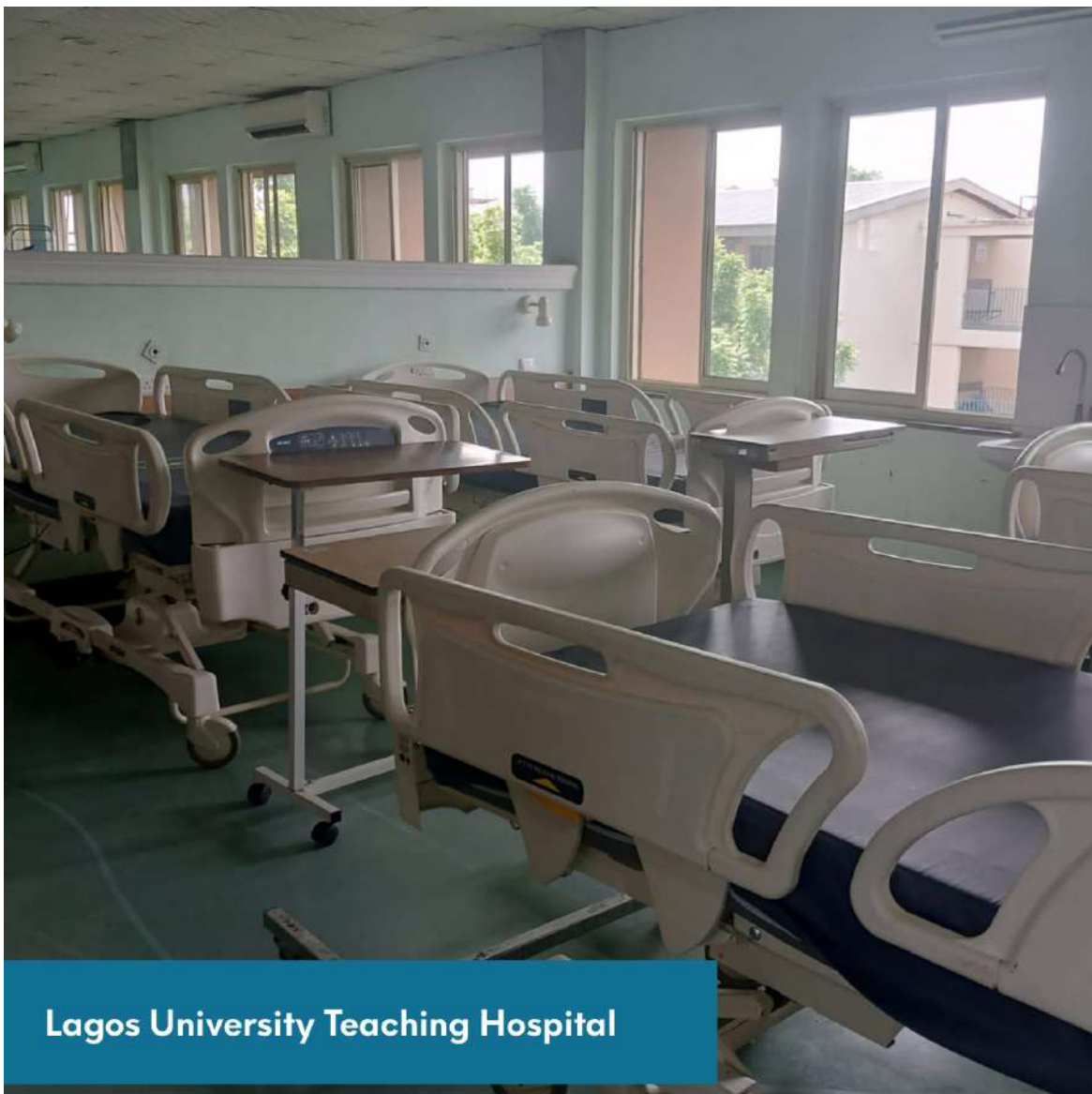
Lagos University Teaching Hospital